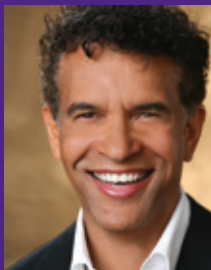
Brian Stokes Mitchell Chairman