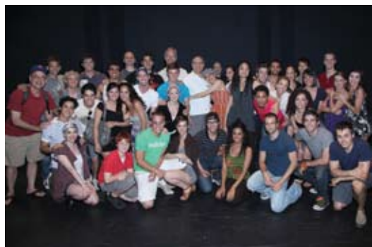
Company of WEST SIDE STORY before their Actors Fund Performance