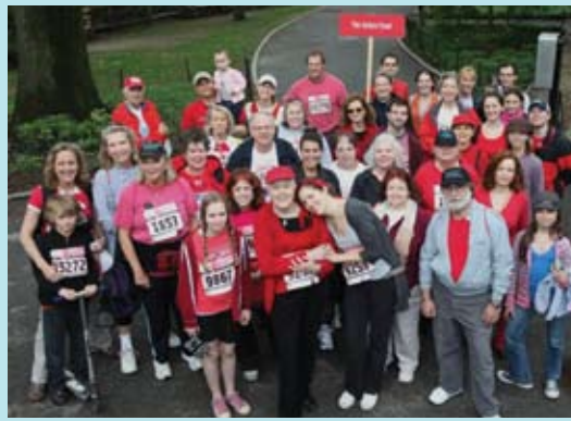
New York (Top) The Actors Fund team led by Captain Lynn Redgrave (center) at Central Park helped raise support for The Phyllis Newman Women's Health Initiative (PNWHI)