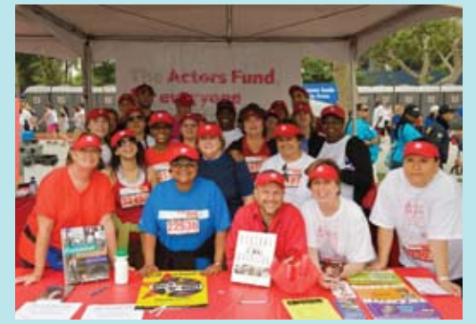
Los Angeles (Right) The Actors Fund team participated in the 16th Annual Revlon Run/Walk for Women in Los Angeles