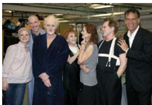
Cast members of EXIT THE KING including Lauren Ambrose, Geoffrey Rush, William Sadler and Susan Sarandon with Brian Stokes Mitchell before their Special Performance