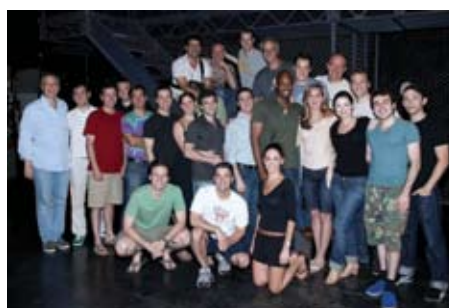
The cast and crew of JERSEY BOYS