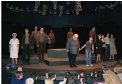
Richard Griffiths, Daniel Radcliffe and members of the company take a bow after their Special Performance of EQUUS