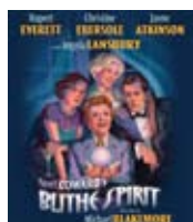
Angela Lansbury and the company of BLITHE SPIRIT backstage after their Actors Fund Performance