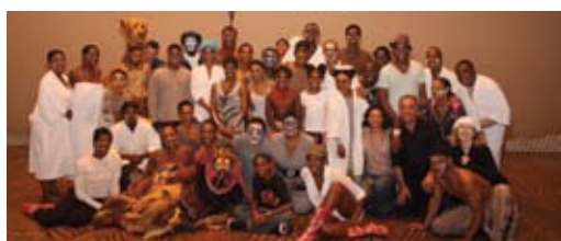
The NY company of THE LION KING. This was the 14th Special Performance by Lion King companies. Since the show opened, $1,480,202 has been raised to help The Fund help colleagues in need all over the country.

The Actors Fund, for everyone in entertainment.