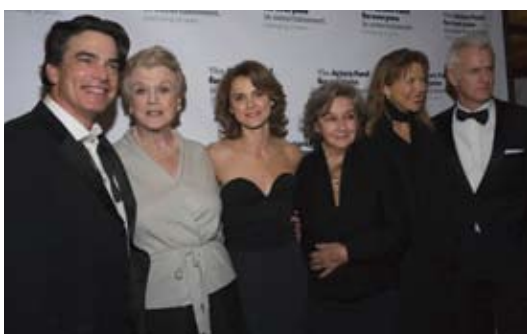
Peter Gallagher, Angela Lansbury, Keri Russell, Zoe Caldwell, Annette Bening and John Slattery at the after-party for All About Eve