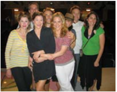
The company of BOEING BOEING at The Fund's Special Performance