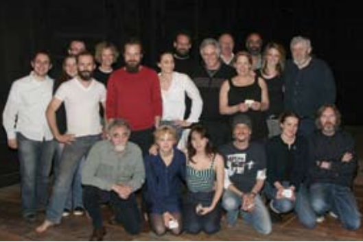
The company of THE SEAGULL at their Special Performance for The Fund.