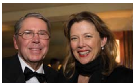
Brian Bedford and Annette Bening celebrated at Bond 45