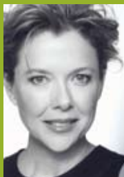
CAMPAIGN CABINET Annette Bening, Co-Chair