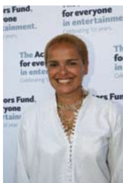
Shari Belafonte at The Actors Fund Annual Tony Awards® Party