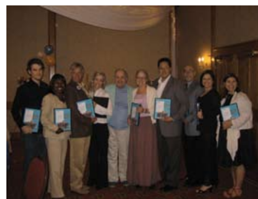
The Youth Leadership Council presented awards to Advisory Committee members in thanks for their work in creating and sustaining the program at Looking Ahead's 5-year anniversary dinner