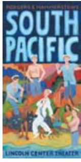
The company of SOUTH PACIFIC at The Fund's Special Performance